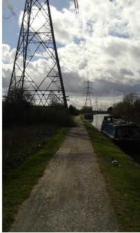
Caption describing picture or graphic.

Much of the content you put in your newsletter can also be used for your Web site. Microsoft Publisher offers a simple way to convert your newsletter to a Web publication. So, when you’re finished writing your newsletter, convert it to a Web site and post it.