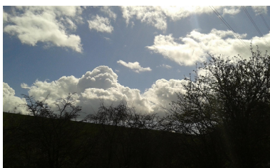
Caption describing picture or graphic.

recommended that you publish your newsletter at least quarterly so that it's considered a consistent source of information. Your customers or employees will look forward to its arrival.