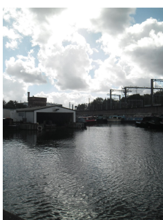
Caption describing picture or graphic.

If space is available, this is a good place to insert a clip art image or some other graphic.