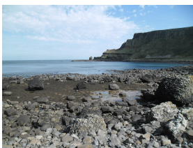
Caption describing picture or graphic.

Once you have chosen an image, place it close to the article. Be sure to place the caption of the image near the image.